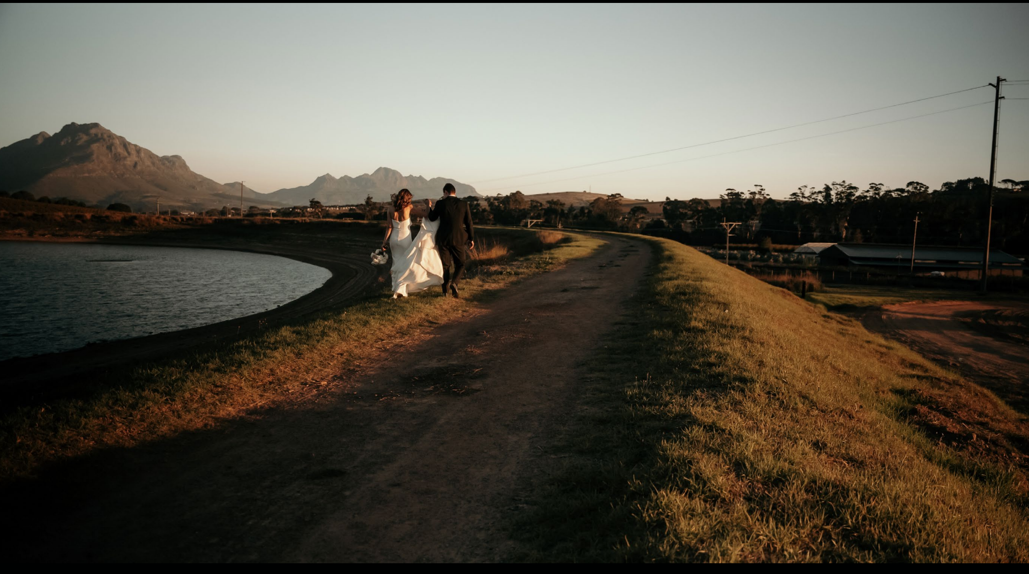
END THANK YOU